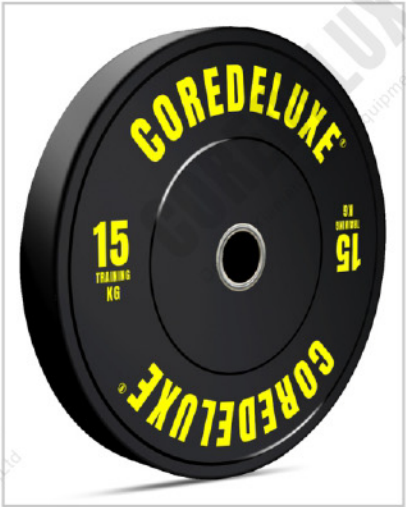
15KG 47MM TRAINING