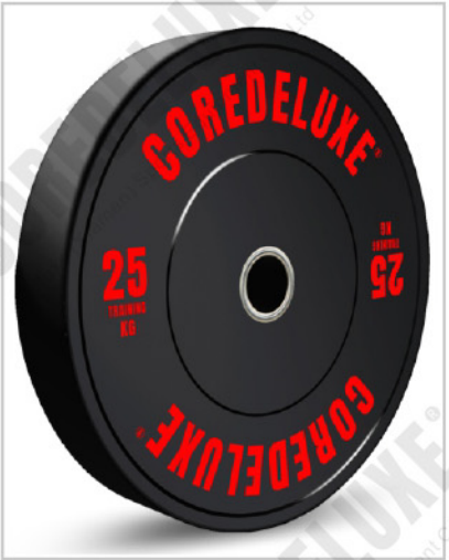
25KG 70MM TRAINING