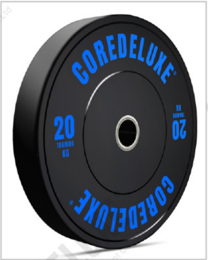
20KG 58MM TRAINING