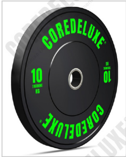
10KG 34MM TRAINING