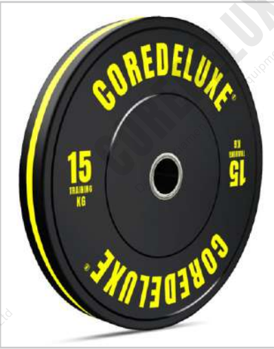
15KG 47MM TRAINING