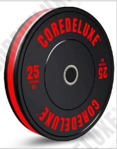
25KG 70MM TRAINING