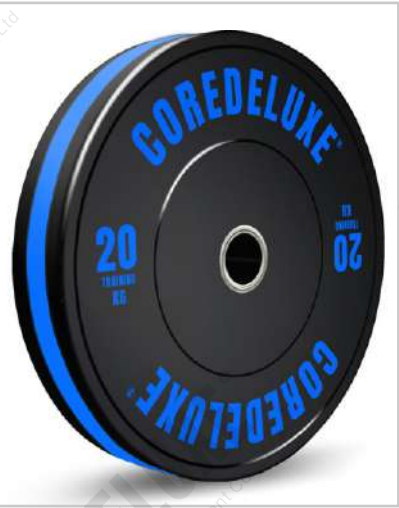
20KG 58MM TRAINING